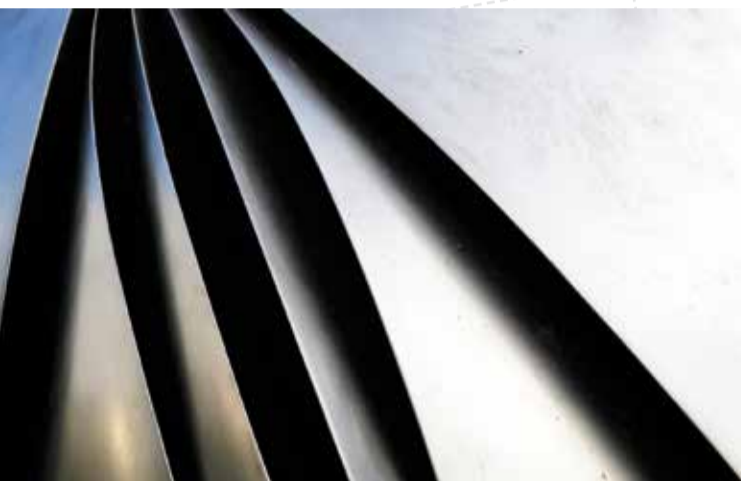
Erich Hauser »Stahl 5/81 (Stahlkugelblätter)« [Steel 5/81 (conical steel leaves)], stainless steel, installed 1981.

» Location: Breite Straße/Aegidientorplatz