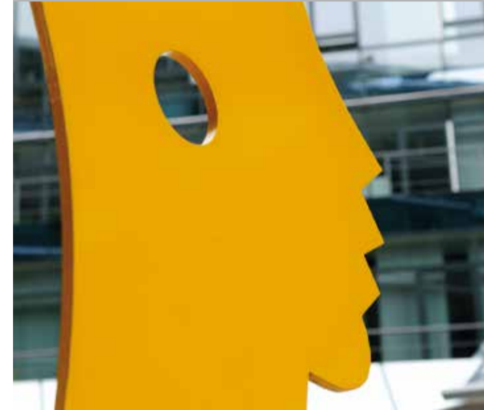
Allen Jones »Summer« lacquered corten steel, installed 2002, relocated 2012.