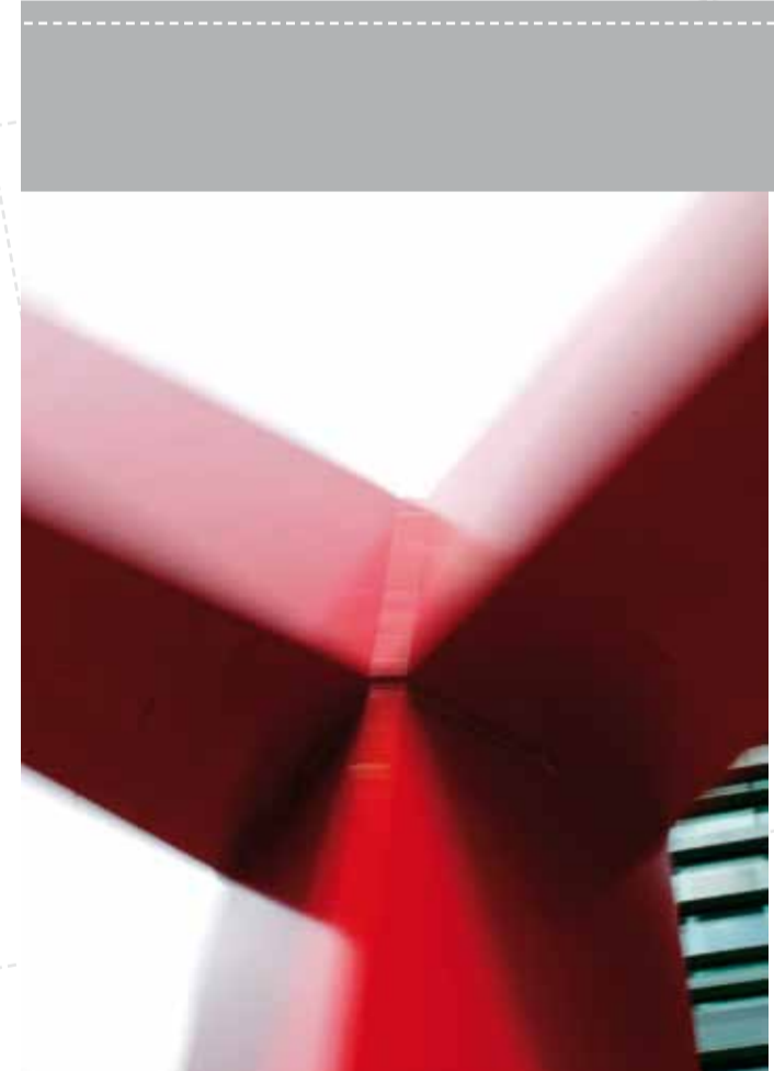
Günter Tollmann »Winkелеlemente 1981« [Angle Elements], lacquered stainless steel, installed 1983.

8 Günter Tollmann (b. 1926 in Gelsenkirchen – d. 1990) occupied himself for decades with fixed and mobile objects that could be set in motion by the wind or by people. His piece »Winkелеlemente 1981« was purchased by the former Kreissparkasse and donated to the city of Hannover. It develops a strong formal reference at its location: the disparate elements make up a flexible three-dimensional frame that enables ever new spaces to emerge while moving – in a certain position it alludes for example to a block that enters into a relationship with the municipal KUBUS gallery on the other side of the Breite Straße. As a frame, the piece in turn underscores an axis from there across Aegidientorplatz and beyond. Until the 18th century, the Aegidientor was an important town gate through which the city of Hannover could be entered from the south – the »Angle Elements 1981« can hence also be seen as a metaphor for the breaking open of historical borders, for unavoidable change and for the significance of flexible structures. Further work in Hannover: »Plastik M II« [Sculpture M II] on Vahrenwalder Straße (near the water tower).