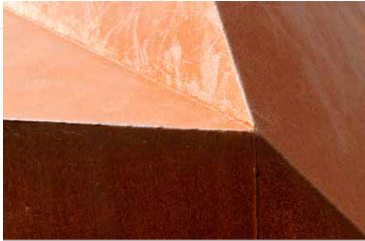
Hans Breder »in between« corten steel, installed 2002, first installed 1971 as »Außenobjekt Hannover« [Outdoor Object Hannover].

4 The sculpture »in between« by Hans Breder (b. 1935 in Herford) was originally produced as »Außenobjekt Hannover« [Outdoor Object Hannover] in conjunction with the »Street Art Programme«, but fell victim to corrosion and vandalism. The artist subsequently created a considerably altered new version in 2002 that was installed near the original location. In his practice as an artist and teacher, Breder was influenced by the interpenetration of a wide range of theories and media. The sculpture »in between« initially makes an all the more minimal impression as a pragmatic steel object. Its concentrated impact, however, can be perceived when following its intrinsic directions, lines and layers – in correspondence to the surrounding architecture and thoroughfares as well as the selection of its location.