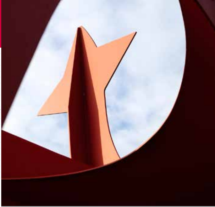
Alexander Calder »Hellebardier (Guadeloupe)« lacquered steel, first installed 1972, relocated 1978.

1 »Hellebardier« by Alexander Calder (b. 1898 in Lawnton, Pennsylvania, USA – d. 1976), which is also known by the alternate title »Guadeloupe«, was given to the city of Hannover in 1972 by the collector and art patron Bernhard Sprengel and can be seen as a commentary on his belief that the »Street Art Programme« lacked cosmopolitanism. It was initially installed in front of the opera house, but after public protests it was relocated opposite the Sprengel Museum in 1978. The sculpture moderates there on the one hand between the culture venue museum and the Maschsee recreational area as well as makes a clear statement in favour of modernism as opposed to the sculptures from the Nazi era preserved on the lakeside (Hermann Scheuernstuhl's »Fackelträger« [Torchbearer] and »Fisch mit reitender Putte« [Fish and Riding Cherub], which are explained at the site, are located in the immediate vicinity).