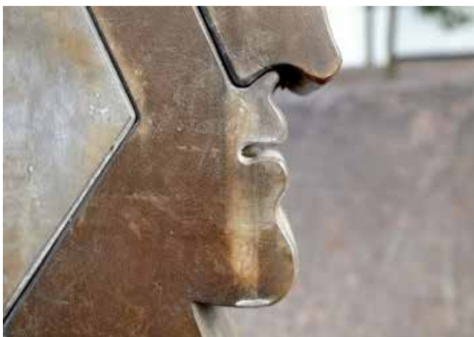
Horst Antes »Figur 1. September« [Figure 1 September], steel and aluminium alloy, first installed 1972, relocated 1983.

» Location: Kurt-Schwitters-Platz (in front of the entrance of the Sprengel Museum Hannover)